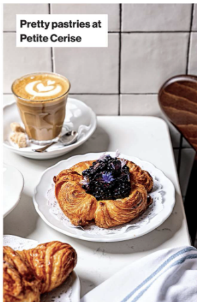
Pretty pastries at Petite Cerise

Sit in a giant birdcage and dig into Vietnamese-accented dishes such as French onion soup with pho broth.