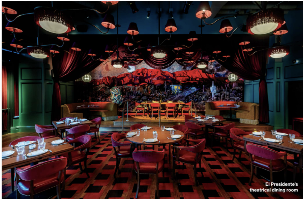
El Presidente's theatrical dining room

The votes are in for our 46th annual restaurant survey: Here's where you most loved to eat in 2023.