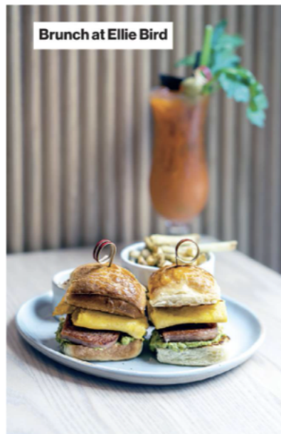
Brunch at Ellie Bird