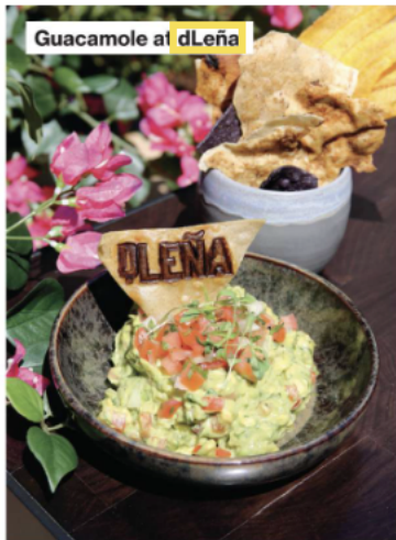
Guacamole at dLeña