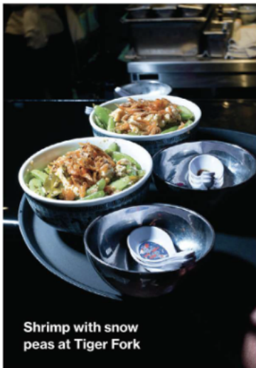
Shrimp with snow peas at Tiger Fork

3. Han Palace, Woodley Park, Capitol Hill, and Tysons Dim sum is served all day at these Cantonese dining rooms, and the Baricks Row location has an all-you-can-eat option.